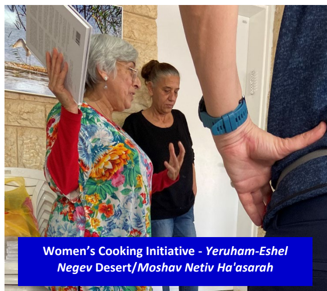
Women's Cooking Initiative - Yeruham-Eshel Negev Desert/Moshav Netiv Ha'asarah